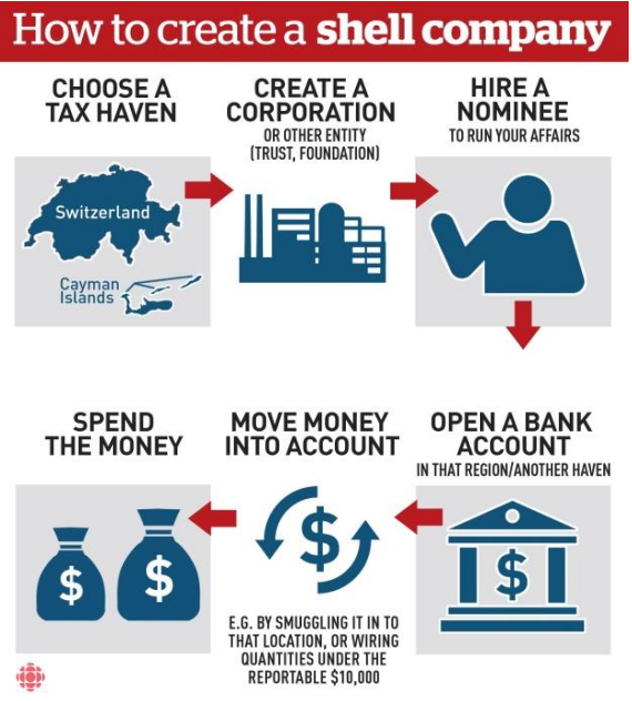
Figure 3, Source:

https://www.corvetteforum.com/forums/politic s-religion-and-controversy/3805083-how-tocreate-a-shell-company.html